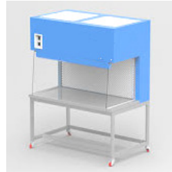
Vertical laminar flow Bench