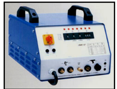
C.D. Spot welder controller