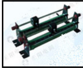
High Power Manual Rheostate