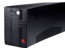
Battery charger 5x8x6" (4.3 kg)

Operating voltage: 12/24 volts, d.c. Frequency: n.d. Temperature coefficient of variation: 10000 ppm Overload: 25% for 5 min Run: four hours Load compatibility: ferrous/non-ferrous Flow ripple: +/- 0.5 percent of rated voltage Flow regulation: 1.0% of full voltage Load: 0.1% of maximum voltage (Line: ±0.05% of full voltage +500mV over specified input range) (Input voltage: ± 1.0% of maximum current for a ± 10% input line change) Control: 1.cascade mode feed back control (constant flow) Protection: Current limit/Current trip Isolation of 3kV DC or better should be provided between positive and ground (Body). Other specs as indicated in datasheet. Size: 10x8x8 inch, 2.6 k.g.