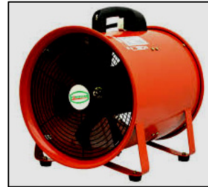
SPEED Vs torque characteristic of blower