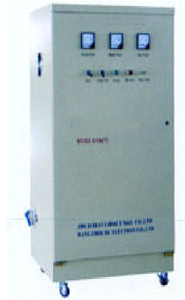
ELECTRONIC TURBINE LOAD SIMULATOR MELT-50120

Technical specifications and selection chart (MELT series)