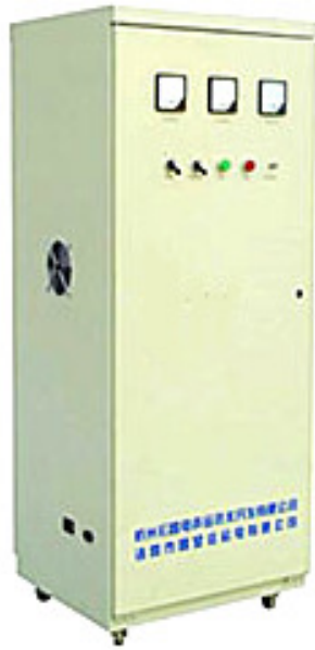
ELECTRONIC A.C. LOAD TESTER MELT-10060